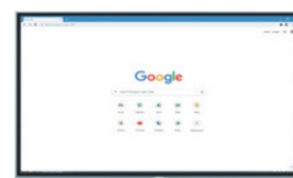
Extended screen (serve as the secondary screen to User's laptop)