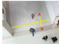
LINE CROSSING Track People or Vehicles Entering / Exiting Designated Areas