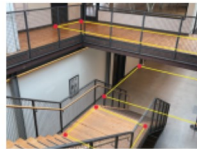
AREA Fully Programmable Regional Intrusion Detection