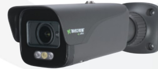
*Also available in Charcoal, VTC-TNB6MEAB