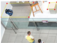
OBJECT TRACKING Track Objects Removed from or Abandoned in Secure Areas