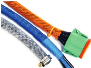
When cut with a hot knife, the sealed ends of Flexo® PET allow for varied termination solutions.