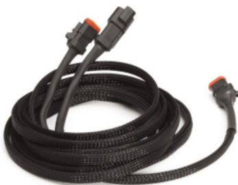
Flexo® PET installs quickly in production harnessing environments, reducing assembly cost.