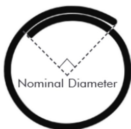
The large overlap allows easy installation over splices and inline connectors without exposing wires and cables.

FLEXO® F6's® (F6N) unique split, semi-rigid braided construction makes it the ideal solution for situations where ease of installation is of primary importance. The lateral split allows the tube to open up to accommodate a wide variety of bundling requirements, while the semi-rigid braid configuration simply closes around the entire installation without the need for any additional fasteners (Velcro, tape, etc.). The 10 mil PET braid is lightweight, quiet, and flexible. The 25% edge overlap (at nominal diameter) allows for coverage around inline plugs, connectors, and splices.