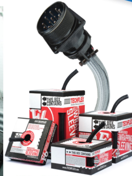
F6® is available in self-dispensing boxes.