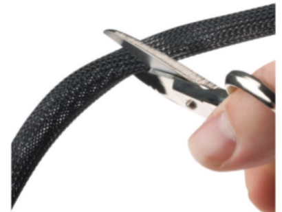
Clean Cut® cuts easily and neatly with regular scissors and maintains a fray resistant end during installation.