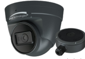
Included Junction Box