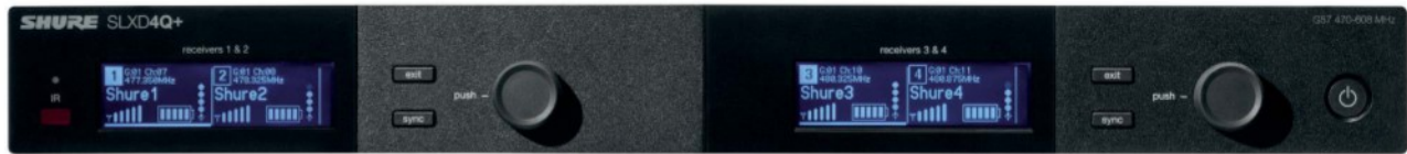
SLXD4Q+ Quad Receiver FRONT VIEW