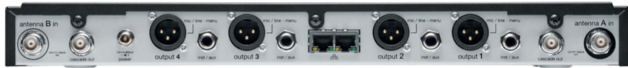
SLXD4Q+ Quad Receiver BACK VIEW