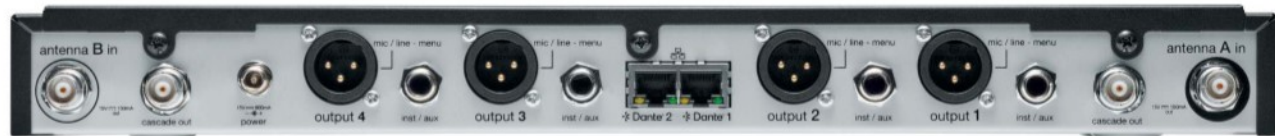
SLXD4QDAN+ Quad Receiver with Dante BACK VIEW