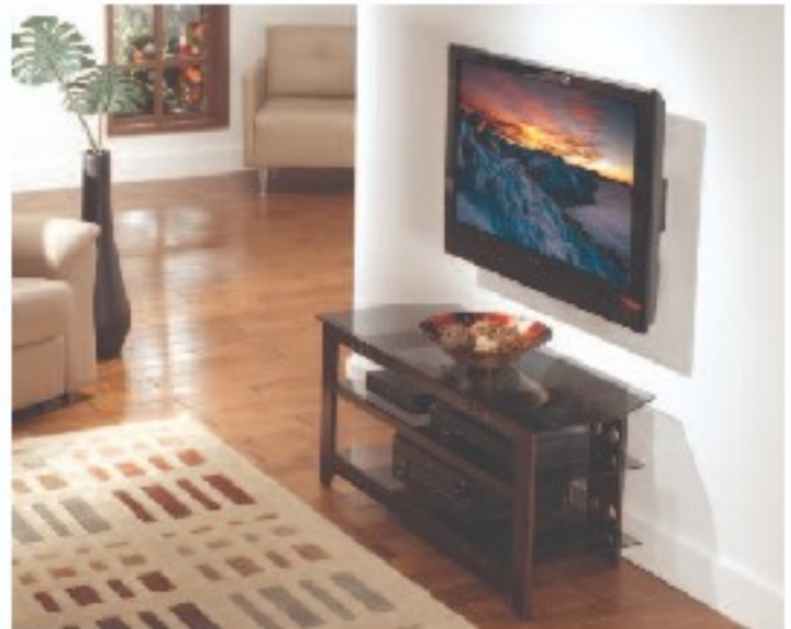
ELM205-B1 in use

The Sanus Elements™ ELM205 is a flat-panel HD power conditioner and surge protector that sits just 1.31" from the wall, so it's perfect for use behind flat-panel TV wall mounts and furniture. Its innovative design includes ClickFit™ compatibility, allowing it to attach directly to select Sanus wall mounts for a flawless home theater installation. Combo Ethernet/phone jack supports up to 100Base-T connection speeds. Dual-stage EMI/RFI filters eliminate noise from 20-50 dB (100 kHz-1 MHz) for superior quality signals.