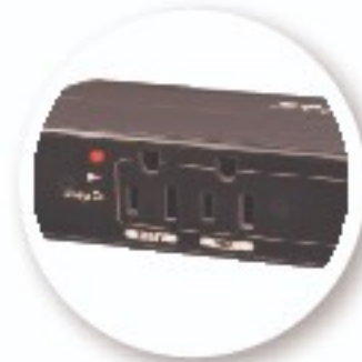
EM/RFI filters eliminate noise