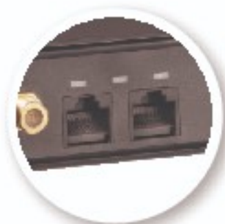
Combo Ethernet/phone jack