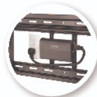
Use behind wall mounts and furniture