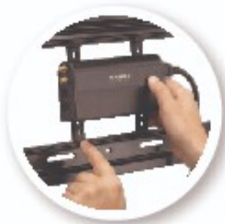
Attaches directly to mount with ClickFit™