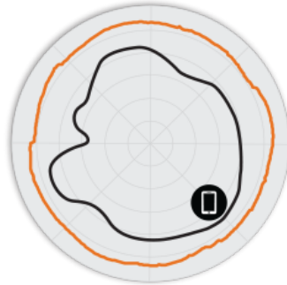
Figure 3. R750 5GHz AzimuthAntenna Patterns