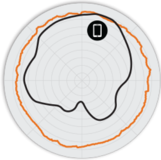
Figure 2. R750 2.4GHz AzimuthAntenna Patterns