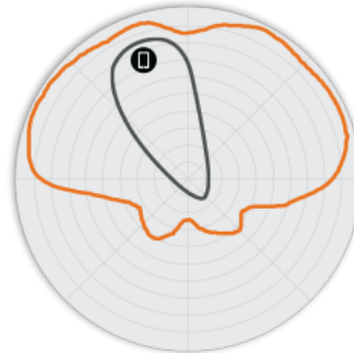
Figure 4. R750 2.4GHz Elevation Antenna Patterns