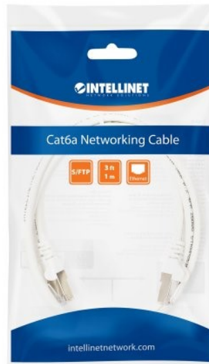
Model Shown: #743204