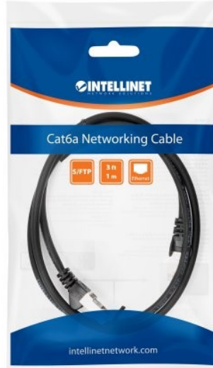
Model Shown: #318761