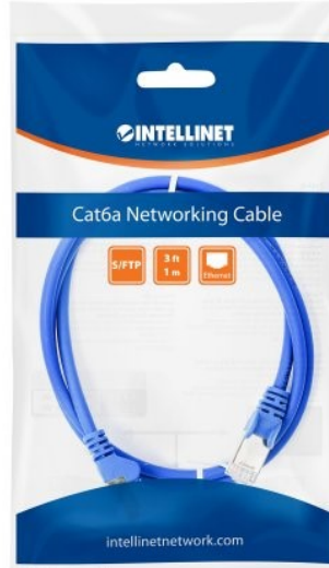
Model Shown: #741477