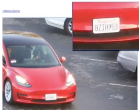
License plate detection and comparison