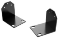
DW-G419RE 19" rack mount ears