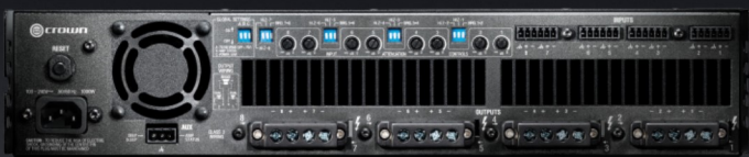
Analog Back Panel