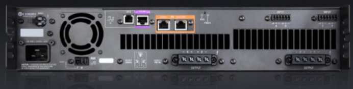
Network Display Back Panel