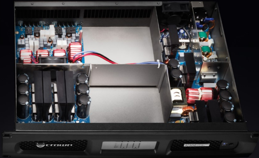
DCi 4|600 | 4X600W

A DCi 4|600 delivers more than twice the power while using just half the space of a CTs 4200 - with almost half the current draw - and drives 100Vrms lines at 600W.