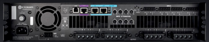
Network Back Panel