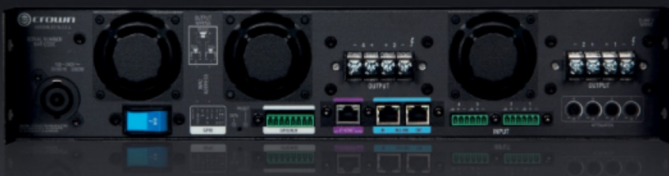
4|2400 Network Back Panel

D - Process Dante audio signals through the Soundweb London BLU-806, BLU-326, or BLU-DAN via BLU link into any DCi Network amplifier.