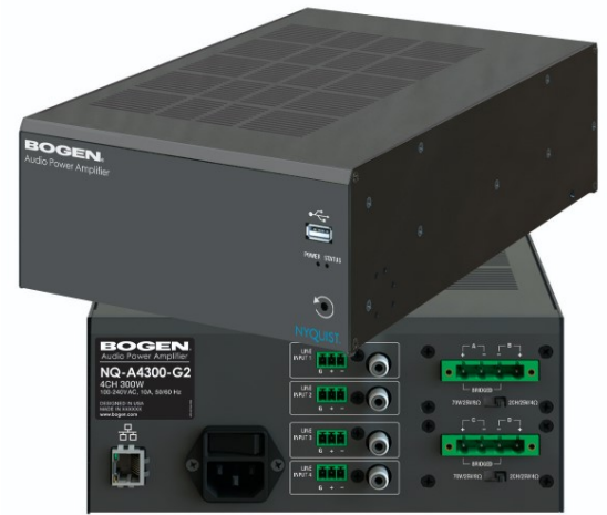
Model NQ-A4300-G2 shown