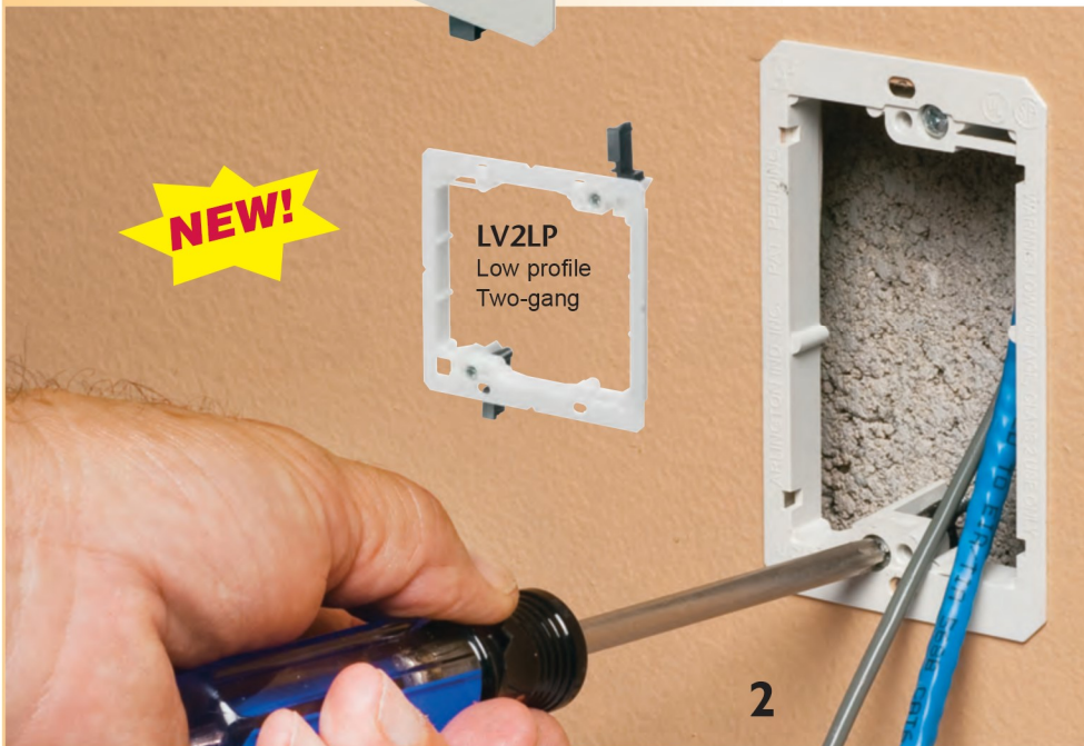
LV2LP Low profile Two-gang