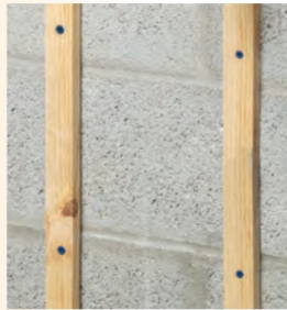
LV1LP Low profile Low voltage mounting bracket

Designed for use with 1/2" or 5/8" drywall installed on furring strips attached to concrete walls.