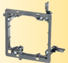
2-gang w/ four mounting wings LV2HD

NEW! Low profile, single- and two-gang mounting bracket for use with drywall installed on furring strips attached to concrete walls... and a heavy-duty, two-gang mounting bracket with four mounting wings for support in each corner.