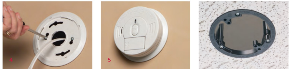
Vertical or Horizontal Mounting