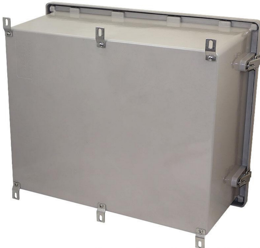
Shown with mounting brackets installed.

Altelix LLC USA: 866-660-9434 +1 561-660-9434 sales@altelix.com www.altelix.com